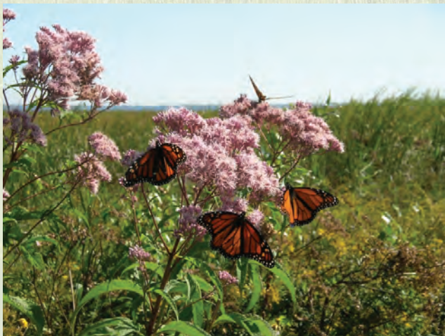
Habitat conditions are excellent for Monarch Butterflies