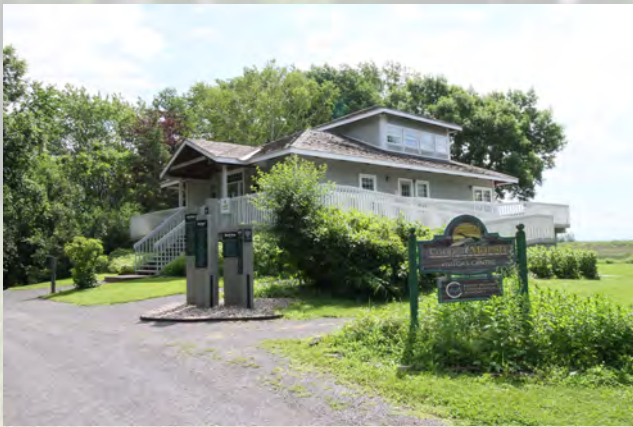
Cooper Marsh Visitors Centre