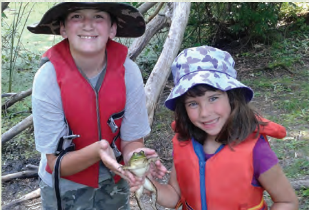
Wildlife educational programs for children